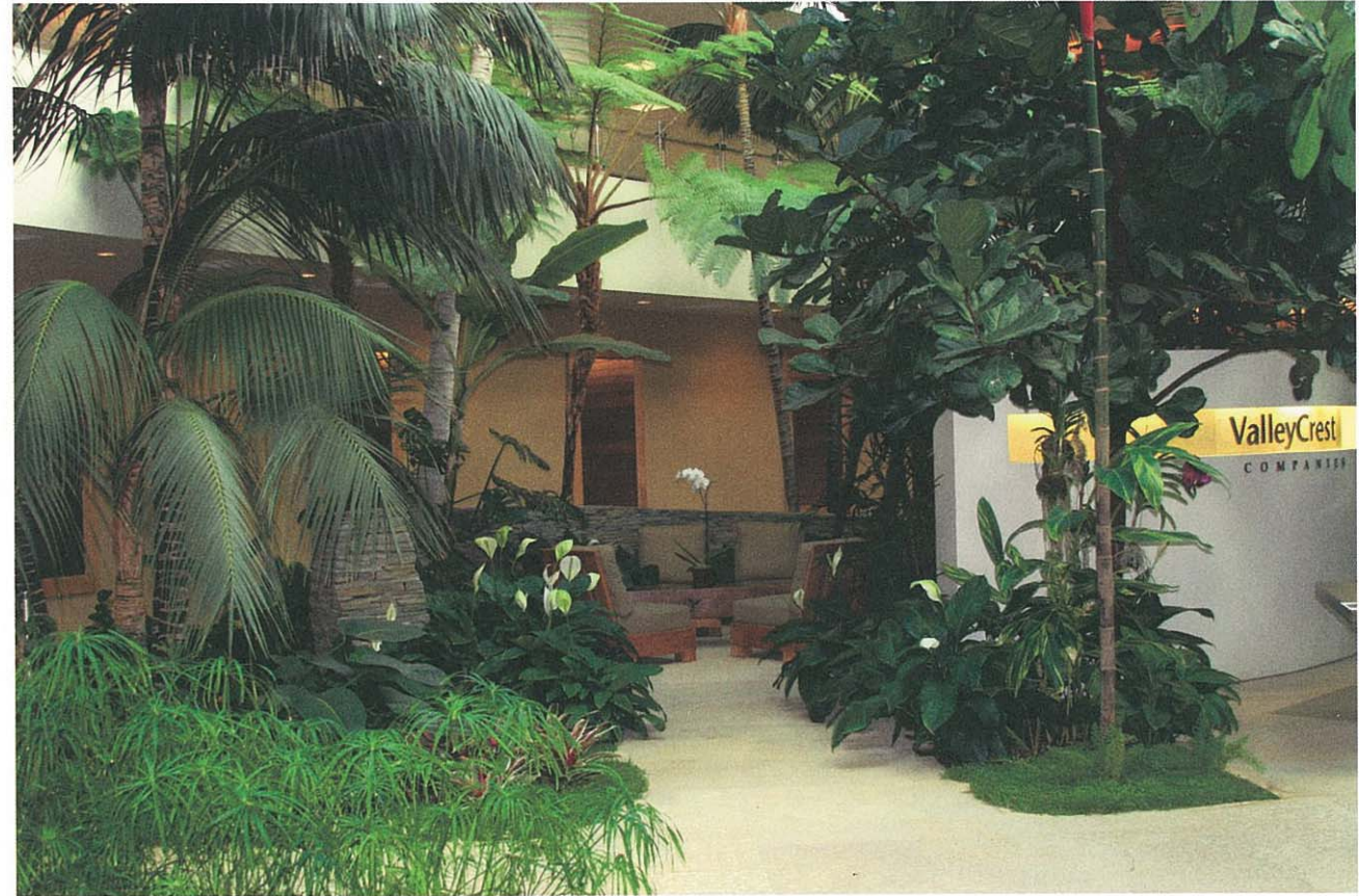
VALLEYCREST CORPORATE HEADQUARTERS Calabasas, California